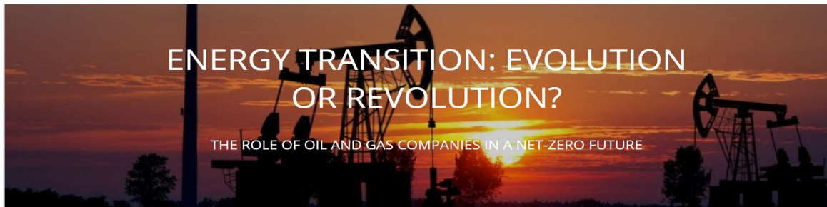
CMS Report - Energy Transition: Evolution or Revolution? January 2020 https://cms.law/en/int/publication/energy-transition-evolution-or-revolution