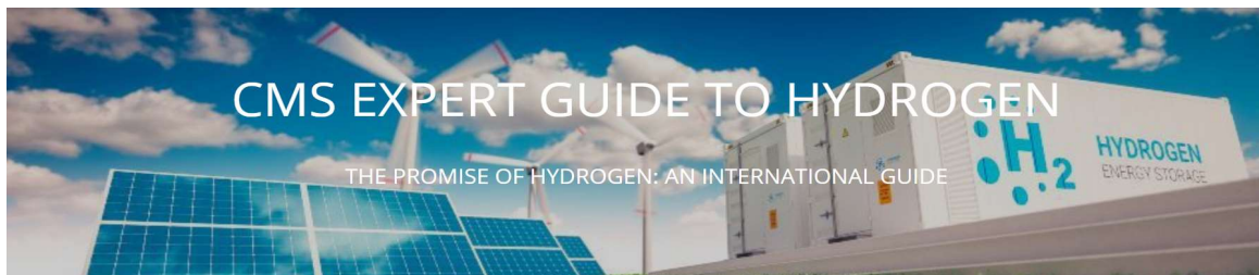
CMS Expert Guide – The Promise of Hydrogen: An International Guide, October 2020 https://cms.law/en/int/expert-guides/cms-expert-guide-to-hydrogen